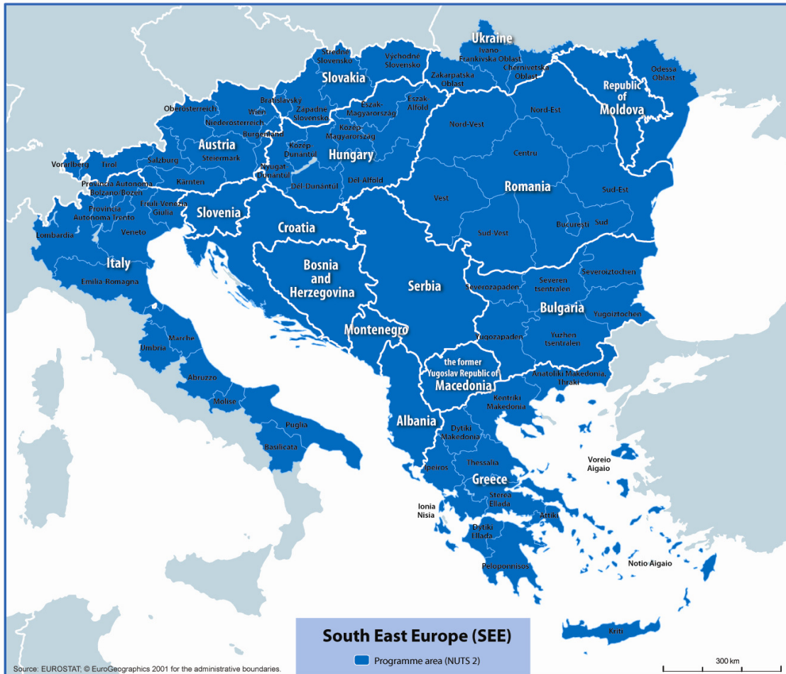
Figure 1 SEE eligible area

The SEE cooperation area is defined by the Commissions Decision of 31 October 2006/769/EC (see Fig. 1).